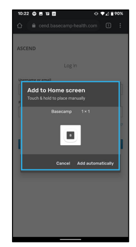
5. Add to Home Screen manually or automatically