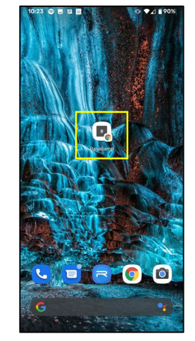
On the home screen, there will be an icon labeled by designated name.